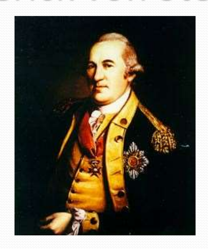
The First IG