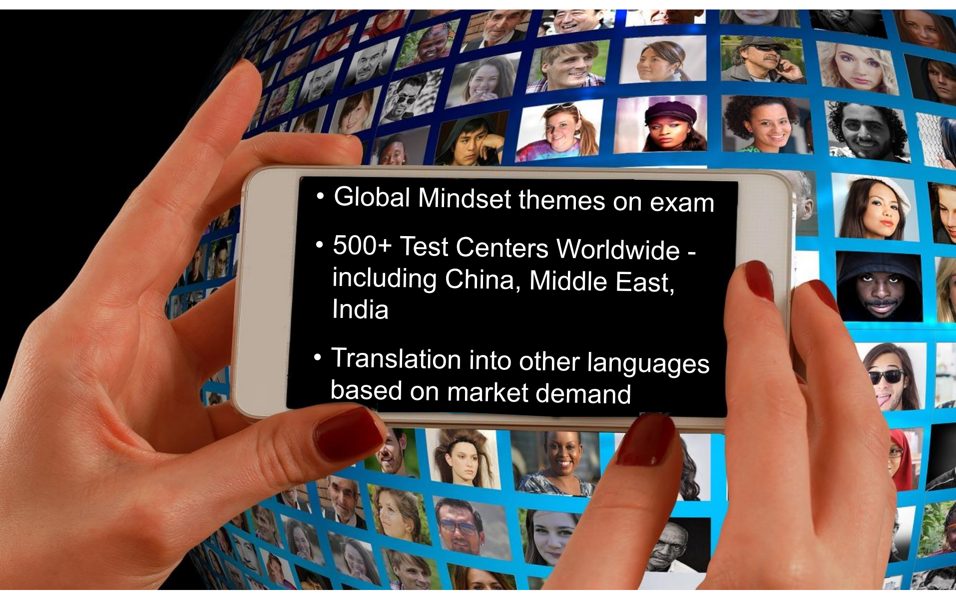
Copyright (c) 2017 by the Association for Talent Development. All Rights Reserved.