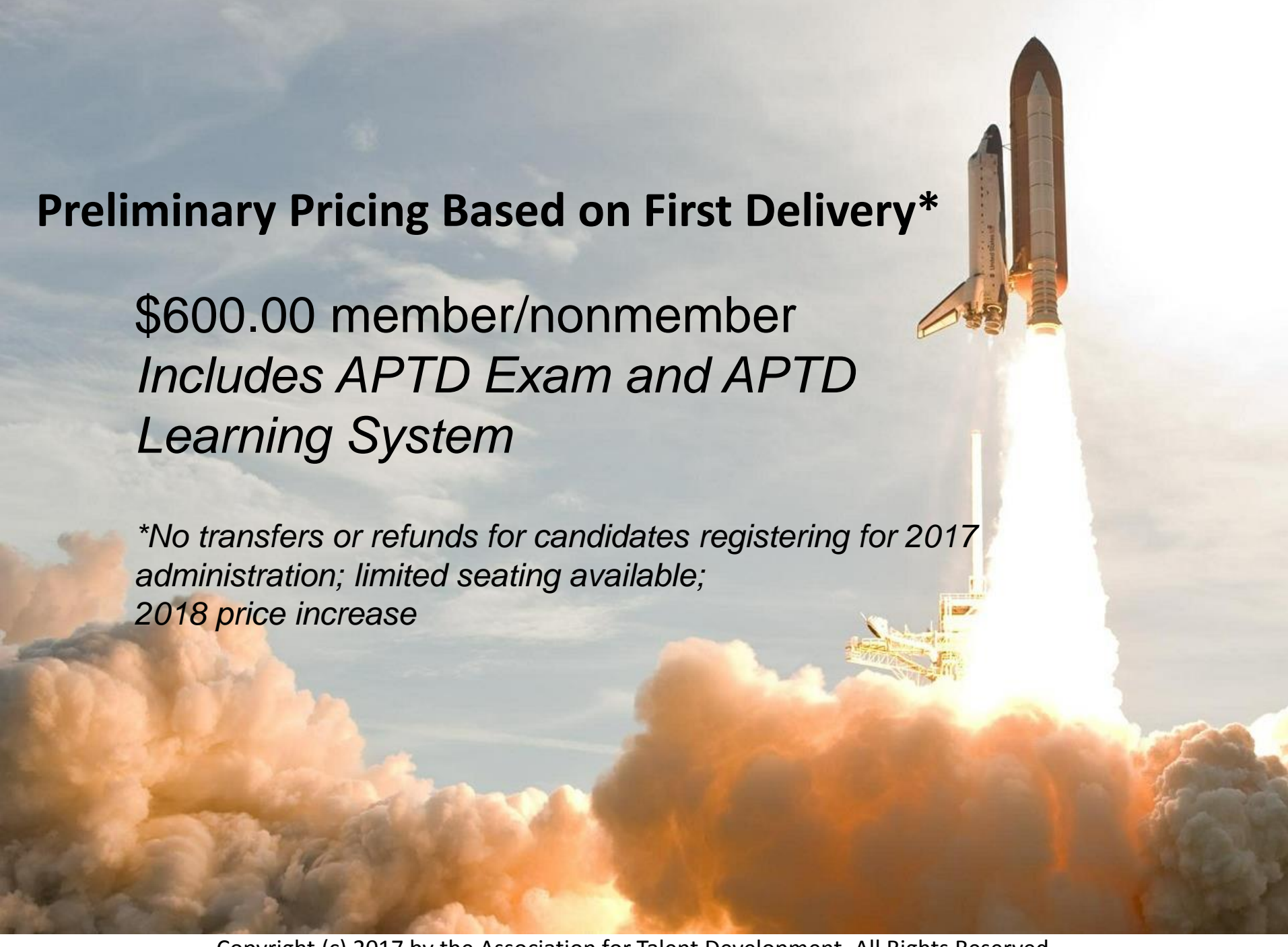
Copyright (c) 2017 by the Association for Talent Development. All Rights Reserved.